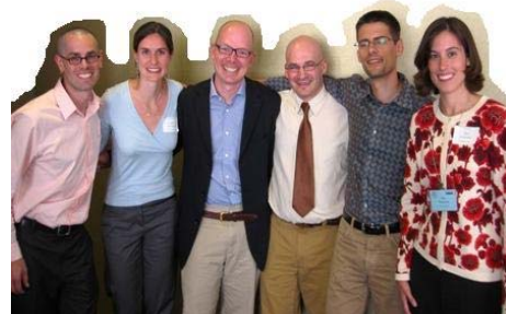
The first SPER workshop was a great success (above).

inference in observational studies, modeling of dependency in pregnancy data, and analysis of biomarker data. Attendance was beyond expectations, with more than 100 people attending the workshop. The program from the Workshop, along with the presented material, is posted on the SPER website.*