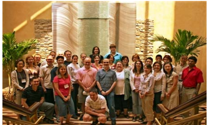
Faculty and students at the NICHD-IHDCYH Summer Institute (above).